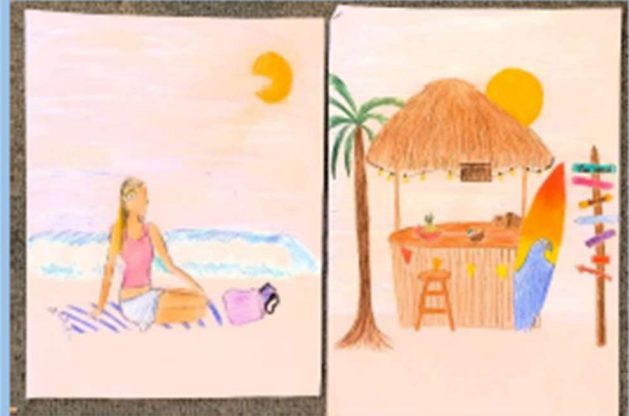
Chloe Marshall – Rm 9